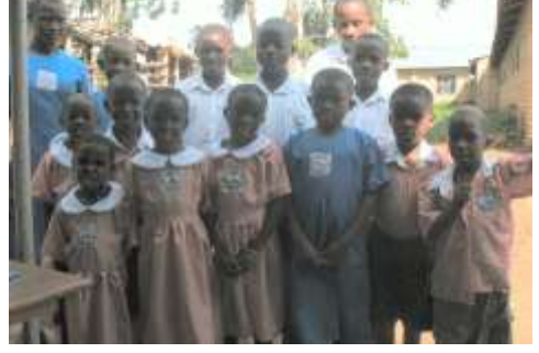
God for the work.